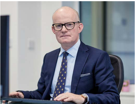
Max Hill KC Director of Public Prosecutions

Our vision for 2025 builds on that progress, providing a framework for on-going success. It is underpinned by the principle of instructing the right advocate for the right case and recognises the value and importance of having a talented, adaptable and diverse cadre of advocates delivering justice for the public we serve through fair and independent prosecutions.