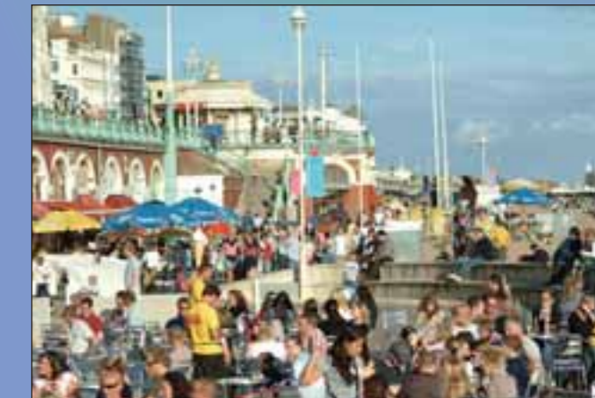
Brighton Sea Front.